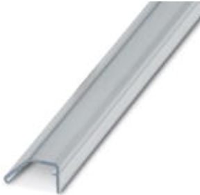
Cover profile, Length: 1000 mm, Color: transparent

Please be informed that the data shown in this PDF Document is generated from our Online Catalog. Please find the complete data in the user's documentation. Our General Terms of Use for Downloads are valid ( http://phoenixcontact.com/download )